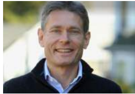
Tom Malinowski (D)