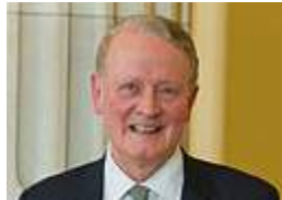
Leonard Lance (R)