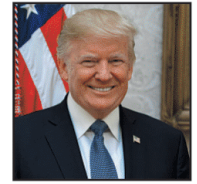
Donald Trump (R)